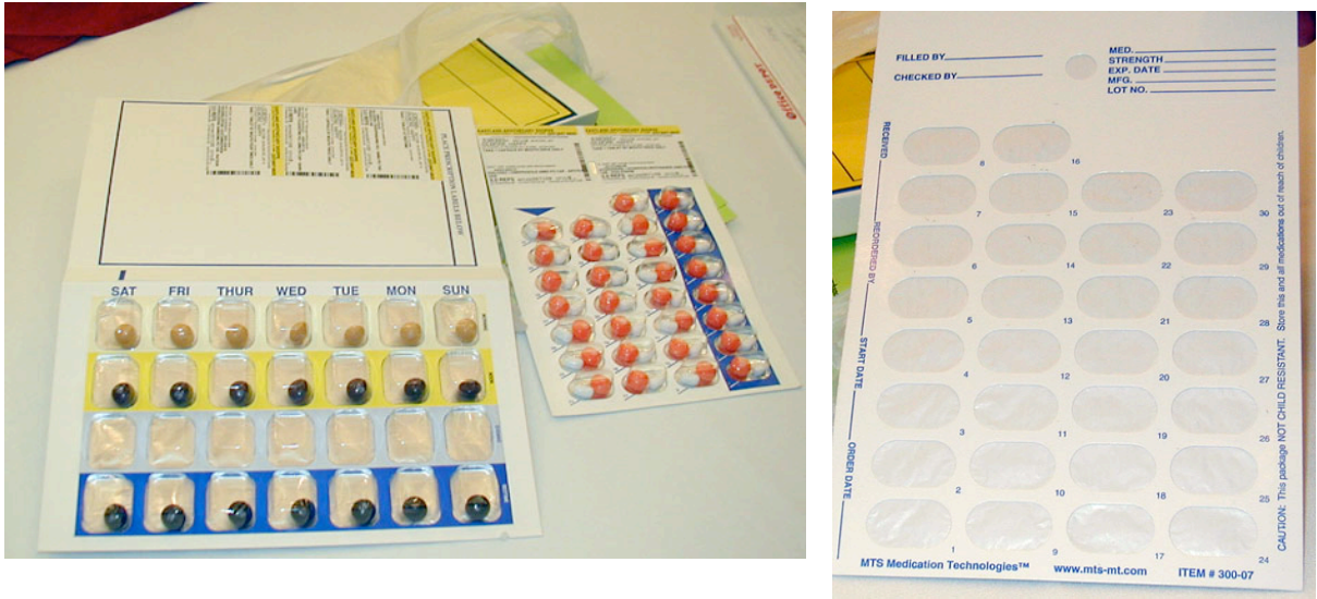
Figure 2. Examples of individual prescription packaging.